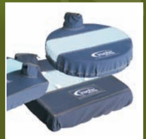
IPS Mould Drop Chutes, Skirts, Mould Curtains and Material Bin Covers

Keeping your moulded parts where you want them